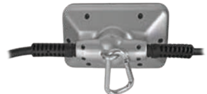
Carabiner on each light head for easy attaching