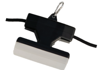
Carabiner on each light head for easy attaching