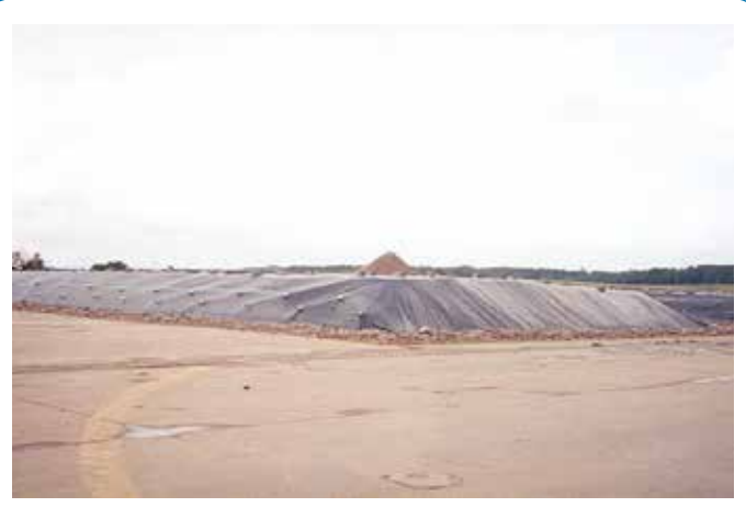
Construction Site Covers

6BB, 6WB and 6WW, respectively, increases outdoor longevity. DURA♦SKRIM® 6 is the first choice for applications requiring greater performance than common 6 and 10 mil plastic sheeting.