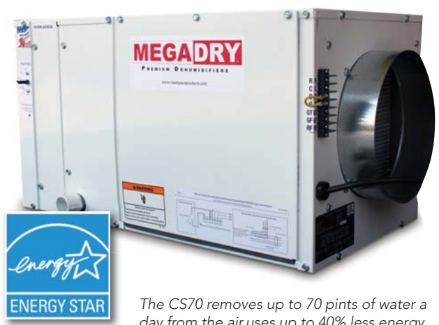
The CS70 removes up to 70 pints of water a day from the air, uses up to 40% less energy than a standalone dehumidifier, and has no messy water buckets to empty!

Hot and humid weather can be tough on homes with basements and/or crawl spaces because of the increased potential for mold growth. Dehumidification is often necessary to reduce the relative humidity in these areas and thus reduce the potential for mold growth. Left unattended, mold can infest the insulation, HVAC ductwork and the living space of your home. Mold can weaken or severely damage the structural components of the crawl space.