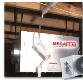
Hanger Kit available for ease of installation.

Tested to ANSI/UL STD 474, and to CAN/CSA Std.C22.2 No.92-197